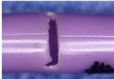
Figure 1: Example of transverse/circumferential crack in the catheter body

BD has identified two additional contributing factors to the increase in material fatigue leaks seen on the 4Fr Single Lumen PowerPICCs in some geographies. Each factor must be controlled in order to minimize the failures.