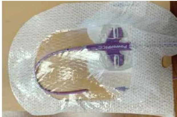
Figure 3: Image of the J-loop